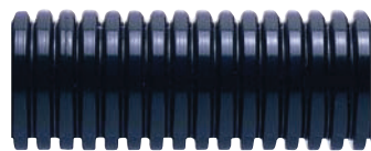
Type PA Standard Weight Conduit