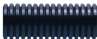
Type PA Heavyweight Conduit